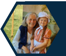
BETSEY GOLON GARDENS